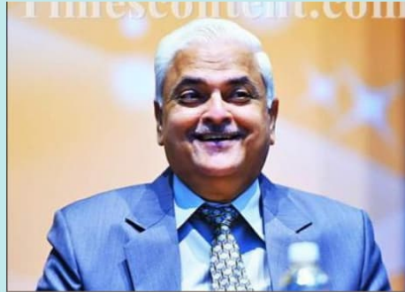
Hon'ble Mr. Justice Anil R. Dave Former Judge of Supreme Court of India