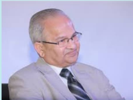
Hon'ble Mr. Justice G.S. Singhvi Retd. Judge of the Supreme Court of India.