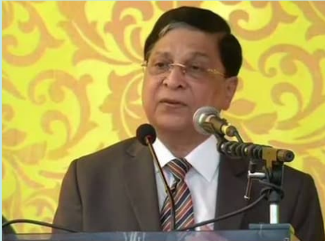
Hon'ble Mr. Justice Dipak Misra Former Chief Justice of India