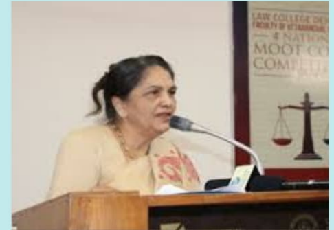
Hon'ble Mrs. Justice Gyan Sudha Misra Former Judge of Supreme Court of India