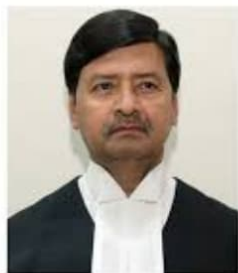
Hon'ble Justice Mr. Ajay Rastogi Judge of Supreme Court of India Former Chief Justice of Tripura High Court Former Acting Chief Justice of Rajasthan High Court