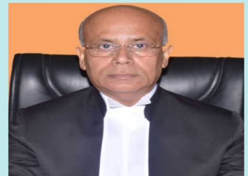
Hon'ble Mr. Justice Navin Sinha Judge of the Supreme Court of India