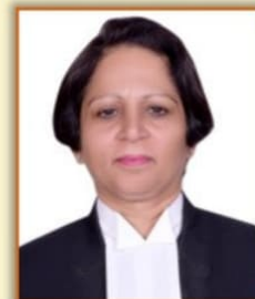
Hon'ble Justice Mrs. Sabina Judge Rajasthan High Court