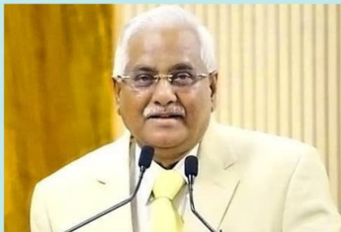
Hon'ble Mr. Justice V. Gopala Gowda Retd. Judge of the Supreme Court of India