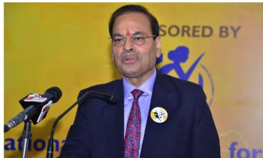
Hon'ble Justice Mr. MN Bhandari Appointed as Judge of the High Court of Rajasthan Transferred to Allahabad High Court