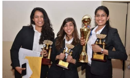
Winners of 7th FYLC Ranka National Moot Court Competition